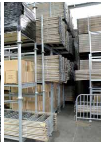
EFS – Stillages make storage and handling of panels simple and space efficient.