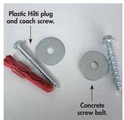
The two types of fixings available.