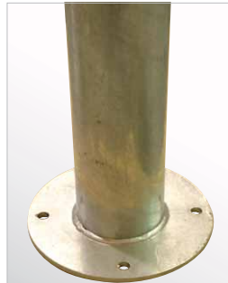
Surface mount flange.

Polyethylene protective sleeves are available to suit round C90 and C140 bollards. For more information see Section 1.1.