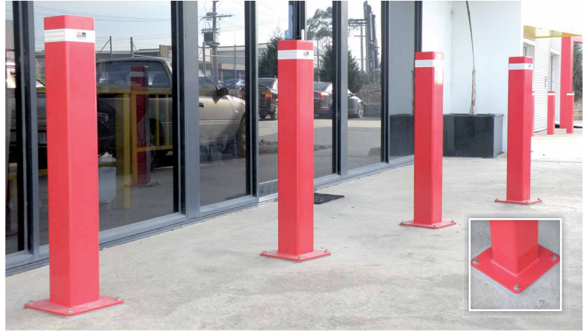
CS150SM Bollards shown.

Our fixed surface mount bollards are designed for traffic control situations or property and asset protection. Manufactured from heavy wall mild steel tube with fully welded base plates, these bollards are able to take the hard knocks. Suitable for installation into any concrete surface. Available in round or square designs. All our bollards are supplied complete with necessary fixings and are available in a hot dip galvanised finish as standard or hot dip galvanised with a powder coat finish.