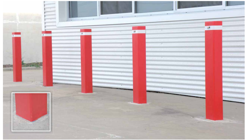
CS150BG Bollards shown.

Our fixed below ground bollards are designed for traffic control situations or property and asset protection. Manufactured from heavy wall mild steel tube with welded starter bars for installation into new concrete footings. Suitable for installation in asphalt or any soft surface where a concrete footing is necessary. Available in round or square designs. All our bollards are hot dip galvanised as standard with the option of powder coated finish.