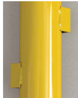
Welded starter bars.

Polyethylene protective sleeves are available to suit round C90 and C140 bollards. For more information see Section 1.1.