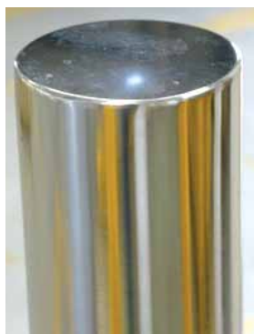
Welded and polished flat cap.