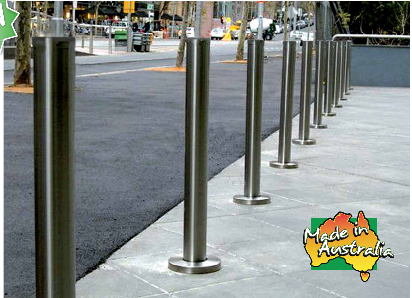
C90SM-SS10 with optional base cover COV90-SS.