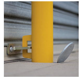
Sleeves with built-in pedestrian cap.