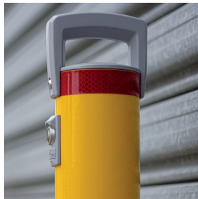
Gal. and powder coated with aluminium caps and handles.