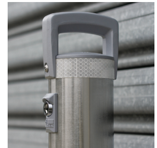
316 stainless steel with aluminium caps and handles.