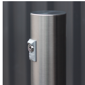
316 stainless steel with flat caps.