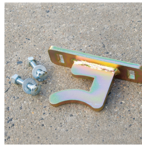
Heavy duty brackets for roller door model.