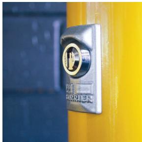
Top quality 'Bi-Lock' security locks.