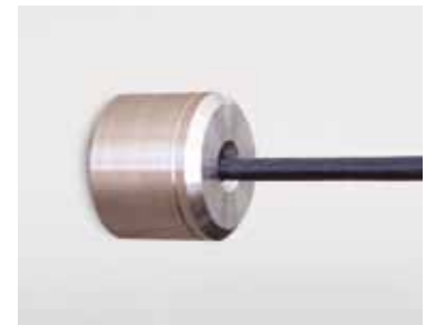
NGWR-SS Wall receiver