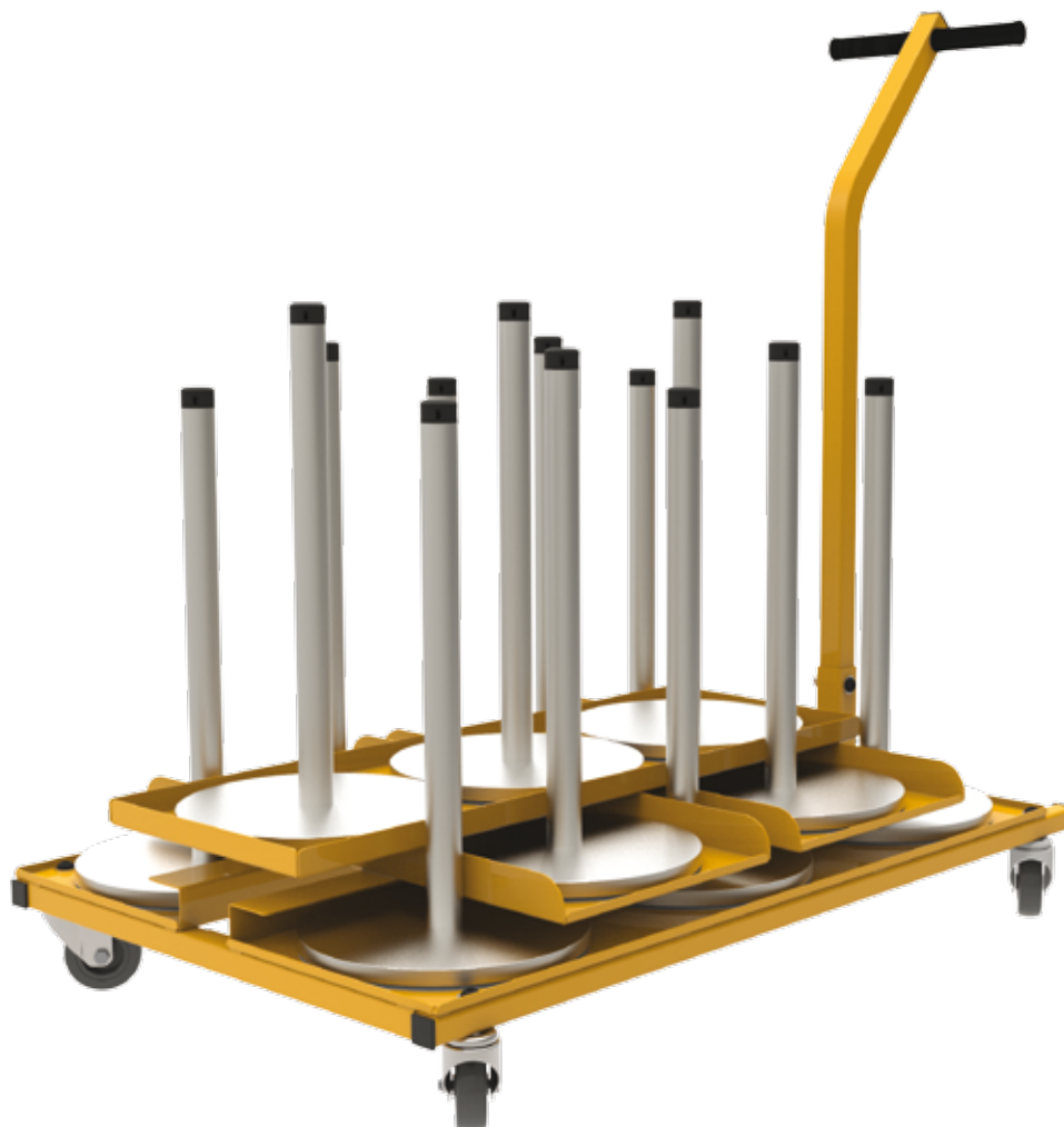
NGST-13 Post trolley for Portable Gallery posts

A heavy duty compact trolley for the storage of up to 13 Gallery portable post and base units. Both 450 and 900mm high models can be accommodated together, without the need for disassembling. Swivelling and locking castors ensure the trolley is stable and easy to manoeuvre when fully loaded.