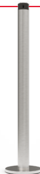
NG450SM-SS Surface mount post 450mm (shown) NG900SM-SS Surface mount post 900mm