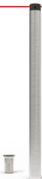
NG450IF-SS In-floor post 450mm (shown) NG900IF-SS In-floor post 900mm NE50-FS In-floor socket (shown)