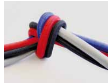
NGEC-BLK Elastic cord – Black NGEC-RED Elastic cord – Red NGEC-BLU Elastic cord – Blue NGEC-GREY Elastic cord – Grey