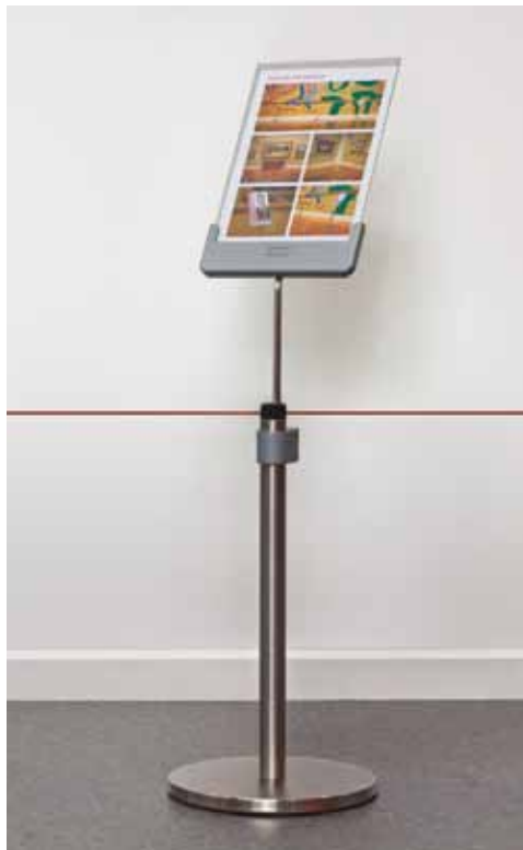
NGSH-A4APM Post angled sign holder NGSH-A4SPM Post straight sign holder NSH-A4SM Surface mount A4 sign holder NSH-A4WM Wall mount A4 sign holder