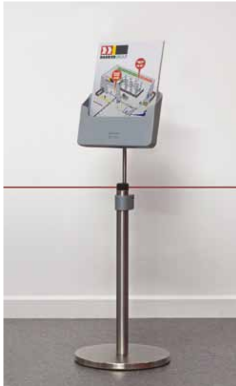
NGBH-A4PM Post brochure holder NBH-A4SM Surface mount brochure holder NBH-A4WM Wall mount brochure holder