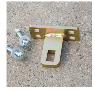
Roller door brackets.