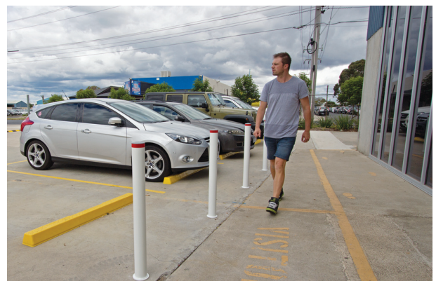
Wheel stops and bollards together provide improved pedestrian safety.