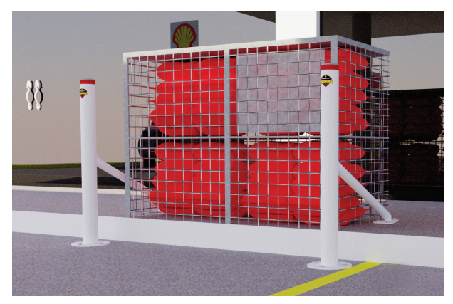
Linebacker BR bollards can be installed onto sloping or stepped ground levels.

Phone us or visit our website for more information!