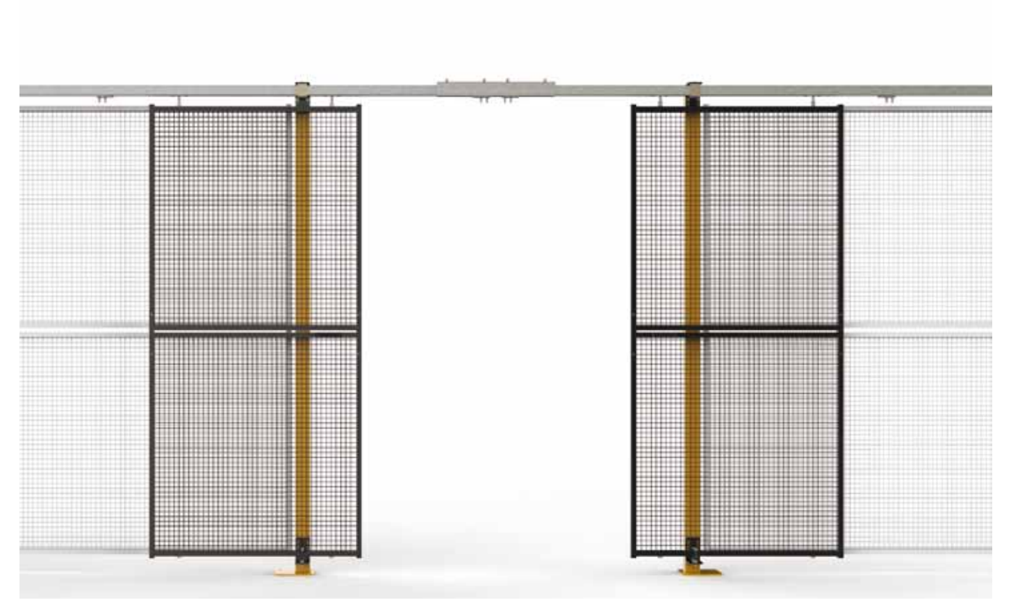
Note: Sliding gates are available in single and double configurations

Copyright © 2018 Barrier Group Pty. Ltd.