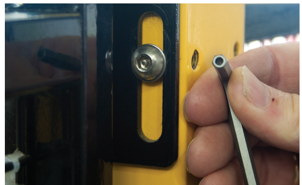
Tamper resistant fixings.