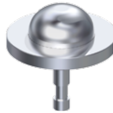
SK30DC-SS Skateboard stud 30mm diameter – Dome top with 50mm dia. collar