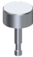
SK30F-SS Skateboard stud 30mm diameter – Flat top