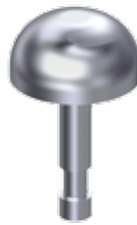
SK30D-SS Skateboard stud 30mm diameter – Dome top