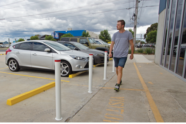
Wheel stops and bollards together provide improved pedestrian safety.