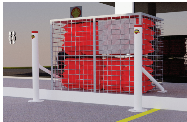
Linebacker BR bollards can be installed onto sloping or stepped ground levels.