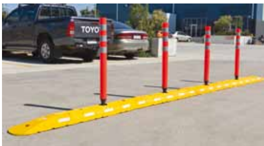
Shown with flexible guide post

Designed for a wide variety of traffic management purposes like vehicle and bicycle lane separation, parking bays and tramways. Also used to mark traffic lanes in car park entrances and exit ramps and protect tunnel walls from possible vehicle impact damage. Optional reflective panels are ideal for low light areas such as underground passages. Fixings included.