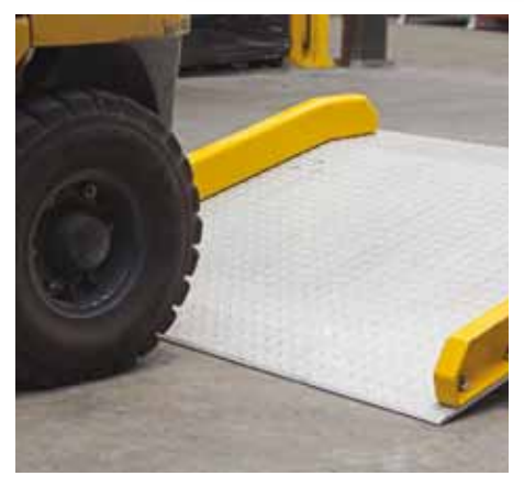
Use with appropriate powered equipment