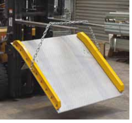
Supplied with lifting chains