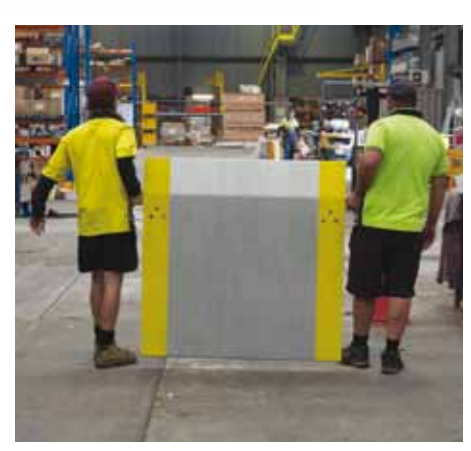
Fitted with carry handles