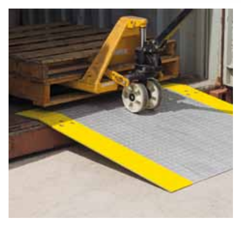
Use with hand trolleys and pallet jacks