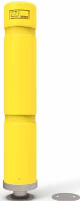
Galvanised steel floor disc, screw fixed or epoxied to floor surface.

A strong magnetic base attaches to a fixed steel floor disc, while a rubber coupling provides the bollard with flexibility on impact. When struck they will always return to the same position. They can be quickly removed.