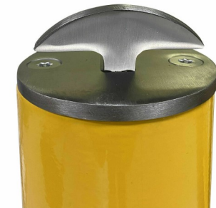
New Modern Design

“new modern urban design bollard with 316 stainless steel handle ”