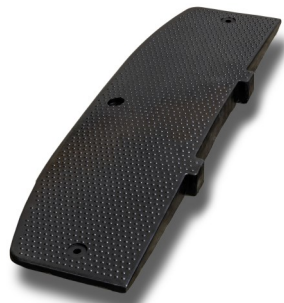
KSC900E End Module